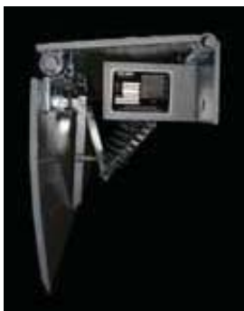
Stored traffic position

The MD-CM Series edge-of-dock leveler from Blue Giant is ideally suited for applications where installation of pit levelers is not feasible or where standard fleet bed heights are serviced at the loading dock. The MD-CM Series is easily installed to the dock face providing an efficient self storing docking unit, replacing cumbersome dock plates.