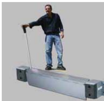
Insert comfort grip handle